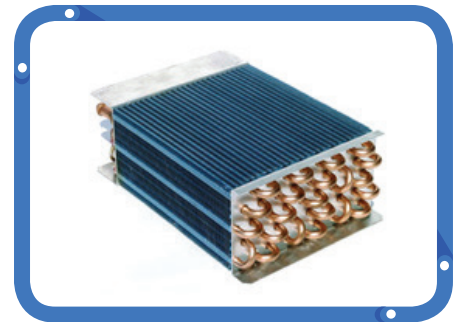
Lordan fine tubed coils

Lordan, a manufacturer of thermal engineering heating and cooling systems since 1958, built a global reputation for delivering high quality custom-made design and supply flexibility, whatever the scope.