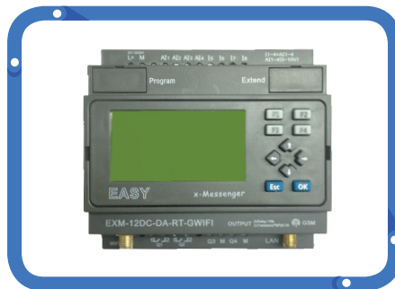
WiFi LeaderMES PLC transmitting relevant data in real time